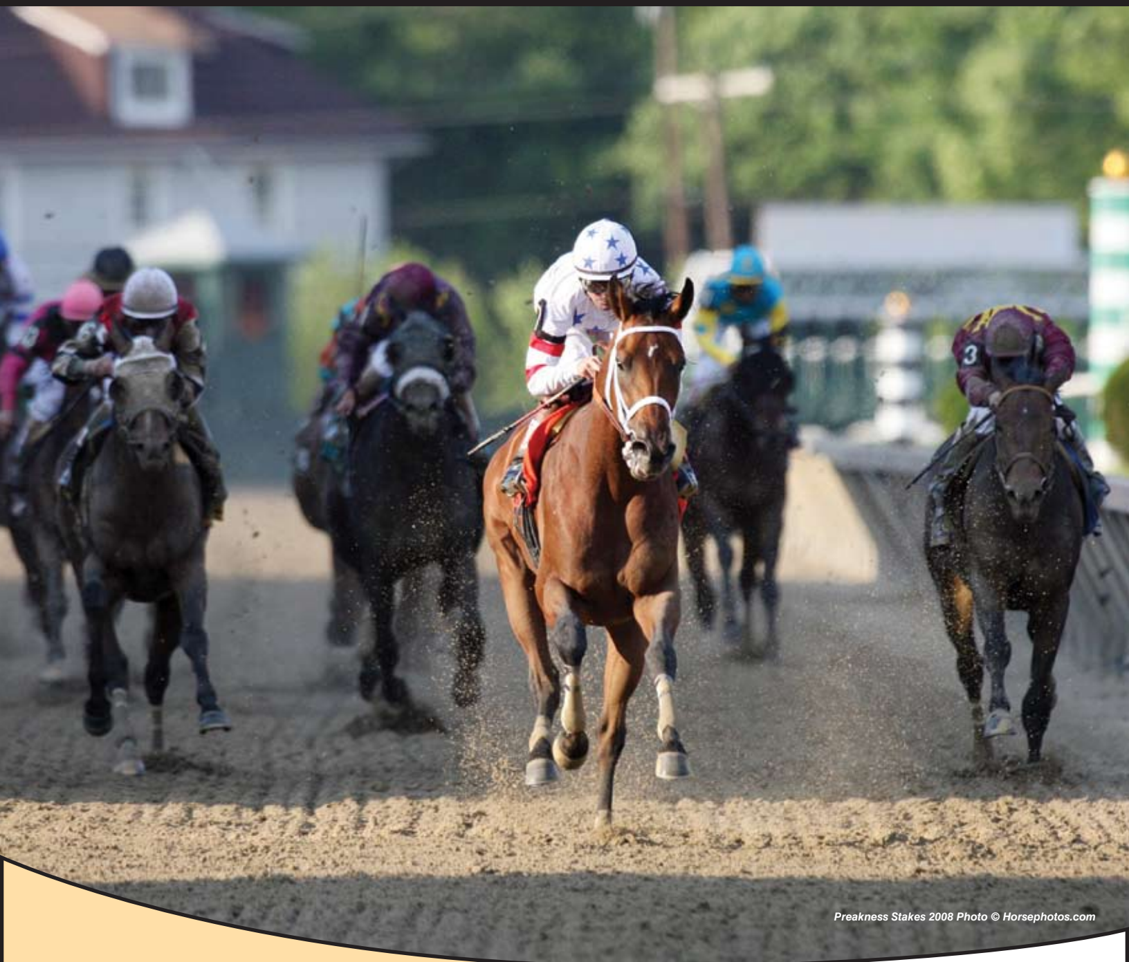
Preakness Stakes 2008